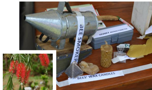
Bottle brush, an excellent bee forage planted at Rwebitaba ZARDI demo apiary

While most farmers only leave bees to fend for themselves, it was important to learn that bees need to be provided supplementary feeding to enrich honey production and of course revenues. A commercial apiary needs an environment that is selectively envired with researched and recommended bee forage; some including Blue gum eucalyptus, Calliandra, Ocimum (omujaja), Angels trumpet, Bottle brush, Vernonia amygdalina (Ekibirizi) among others.