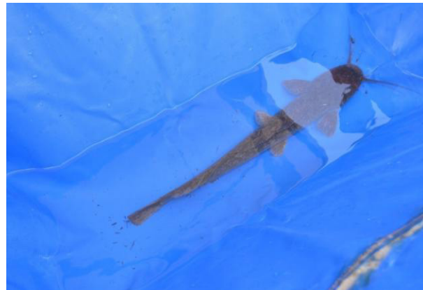
Photo: Cat fish, of the fish species promoted at Rwebitaba ZARDI

Farmed fish is gaining commercial and household food security importance and for reason Rwebitaba ZARDI is sharing practical knowledge with farmers and also providing quality seed for farmers undertaking aquaculture. Farmers were exposed to backyard and cage fish farming systems.