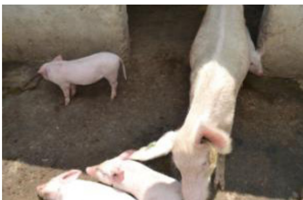
Piggery production unit. ZARDI was challenged by farmers to begin IMO trials

The farmers however challenged the institute to keep-up with new discoveries in livestock production systems such as the natural deep bed system that uses indigenous micro-organisms (IMO's) to create and maintain healthy environment for commercial production.