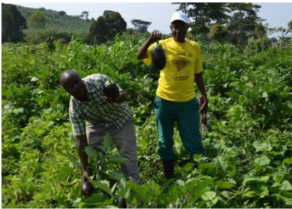
Enhancing farmers’ access to climate change adaptation technologies in agriculture; the role of government, private sector, CSOs and farmers, 26th July 2016, Rwebitaba ZARDI, Kyembogo, Fort Portal