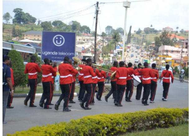
Protect Mother Earth; My Responsibility, Your Responsibility, 27th July 2016, Streets of Fort Portal

As a way to recruit as many climate change agents, KRC and Kabarole District Local Government addressed a group of Boda-Boda men at the Fort Portal main roundabout in what appeared to be an initiation moment. The Boda-Boda men were given reflector rider jackets to inspire them join the climate change fight. The jackets imprinted with the words, "Preventing Climate Change, My responsibility... Your responsibility", were meant to be used by the riders as communication tools to the riders themselves and their passengers on the subject of climate change. They joined the street match through Fort Portal town