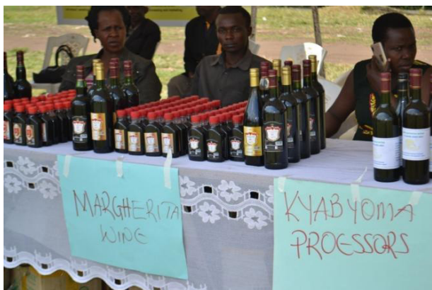
Turning climate change challenges into private sector business opportunities, 27th – 29th July 2016, Boma Grounds, Fort Portal