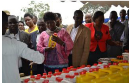
Edible vegetable oil from sunflower processed by Kyempara Farmers Cooperative

Value addition enables farmers benefit more from their farms, and producing a range of products that fetch an extra shilling. During the climate change week, farmer proved that they are steadily treading this path. A range of final products are being produced from bees, bananas, and sunflower seed.