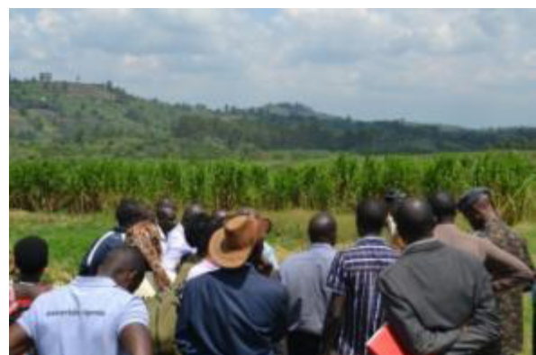
A tour of the livestock fodder production site