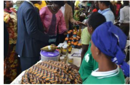
Bee products processed by Bunyangabu Beekeepers Cooperative