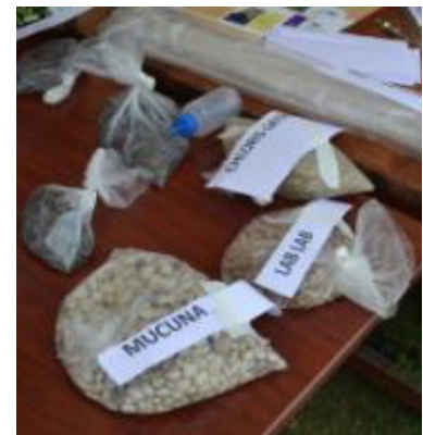
Livestock fodder promoted at Rwebitaba ZARDI

sweet potato genotypes that are Vitamin A fortified. These varieties are excellent boosters of body immunity, vision and health