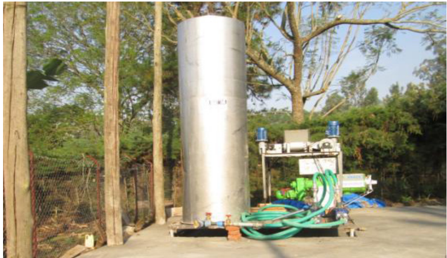
The KRC Bio-refinery Plant

For livestock farmers, the discourse on household food security without the thought of livestock food security makes inadequate meaning. This appreciation led KRC to consider an investment into Bio-refinery to process high protein content livestock feeds, including protein concentrate and whey juice. These products will contribute to quality production of dairy, poultry and piggery products.