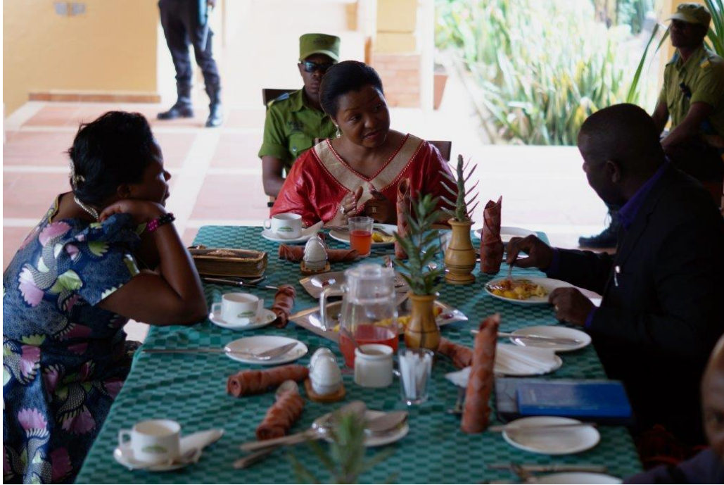
The queen having breakfast at Mountains of the Moon Hotel, with the KRC Team

She stressed that Rwenzururu Royal Guards are not warriors but guards of the royal family of OBR.